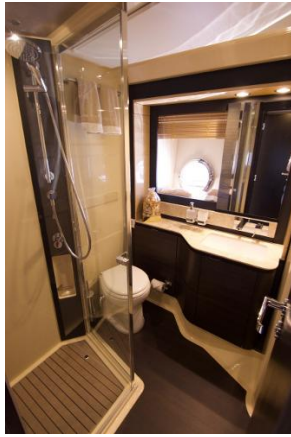
Guest Head and Shower