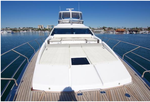
Foredeck Sun Pad and Seating