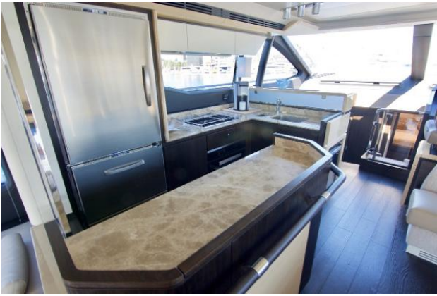
Galley and Bar