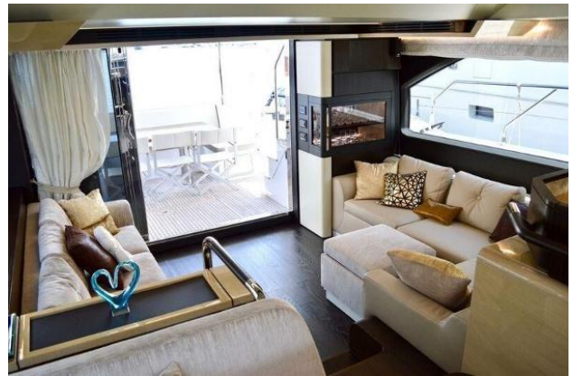
Main Salon Aft