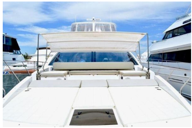
Foredeck Lounge Covered