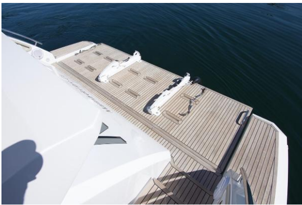
Submersible Swim Step with Dinghy Chocks