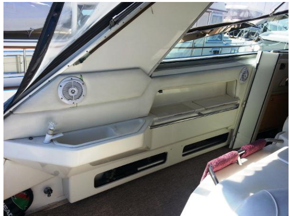
Cockpit Wet Bar