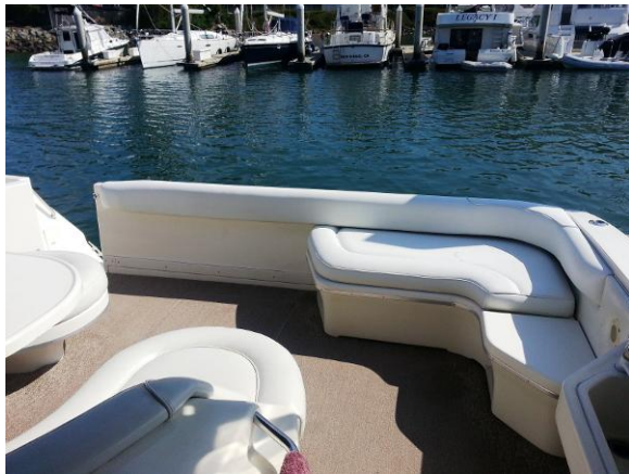
Port Starboard Seating